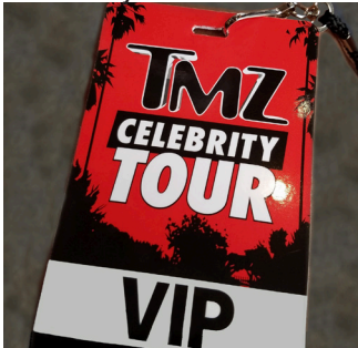
TMZ Celebrity Tour