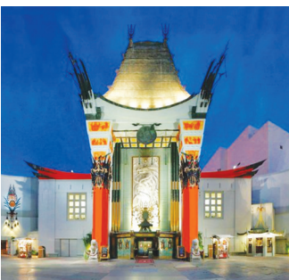
TCL Chinese Theatre