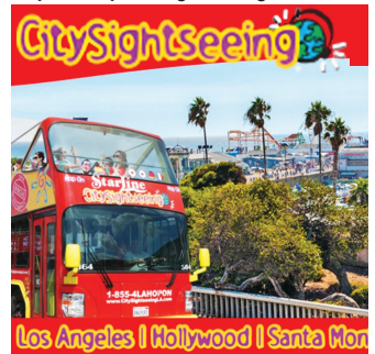
Downtown Los Angeles