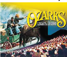
Ozarks Legacy & Legend