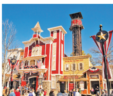
Silver Dollar City