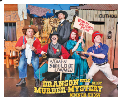
Murder Mystery Dinner Show