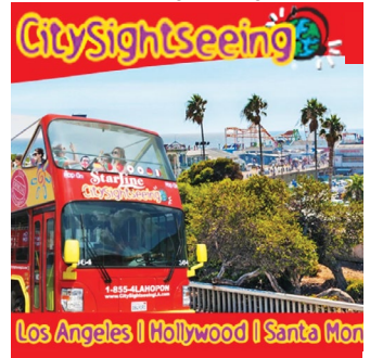
Downtown Los Angeles