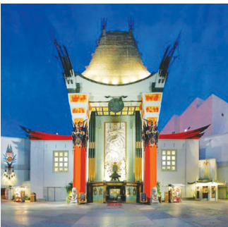
TCL Chinese Theatre