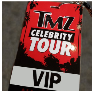
TMZ Celebrity Tour